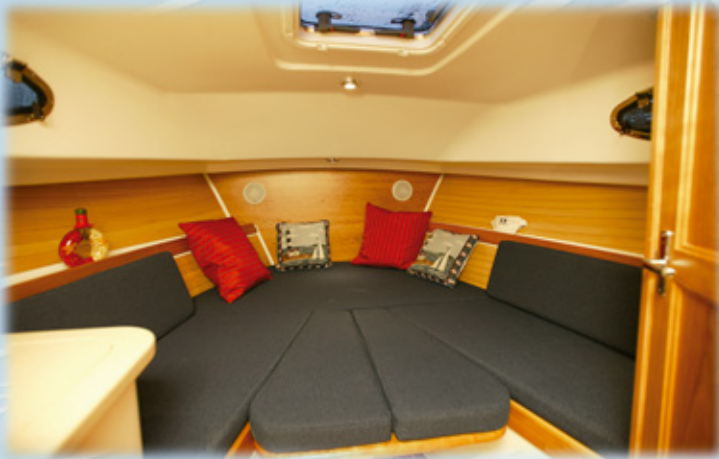
A vee-berth with drop-down, inlaid table, sleeps two comfortably.

The interior accommodation of the Back Cove 26 is bright and airy. Finished in hand-varnished American cherry, her interior joinery is finely built. This space is warm, welcoming and gives a sense of luxury.