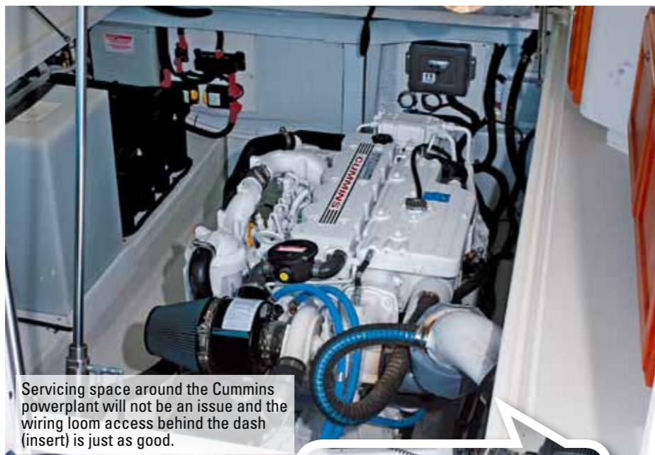
Servicing space around the Cummins powerplant will not be an issue and the wiring loom access behind the dash (insert) is just as good.